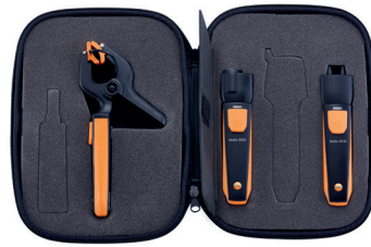
Hydronic Heating Smart Probe Kit: 0563 0004