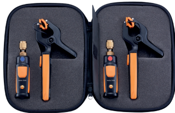
Refrigeration Smart Probe Kit: 0563 0002